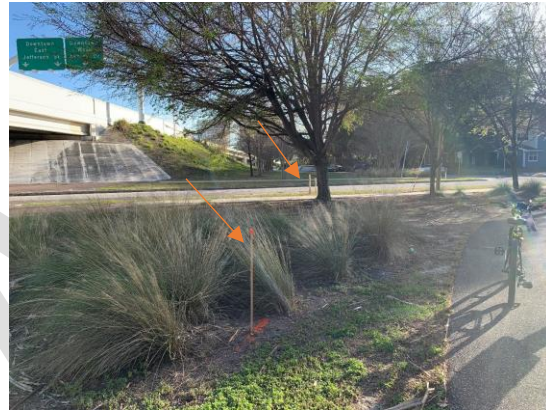
Near 7 th Ave, looking south. Mobley Park apartments are ahead on the right.