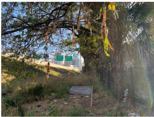
South of Henderson Ave looking south.