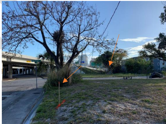
South of 7 th Ave, almost at Henderson, looking south