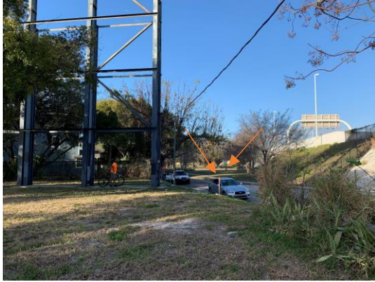
At Henderson Ave looking back north