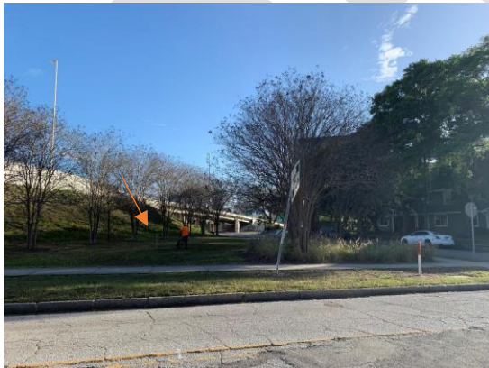
7 th Ave looking south