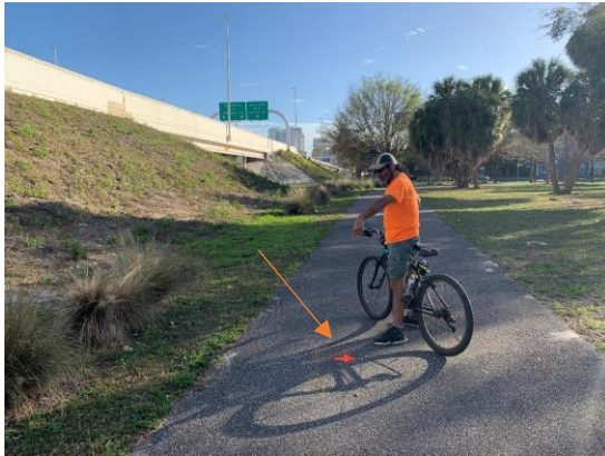
South of Palm Ave, looking south