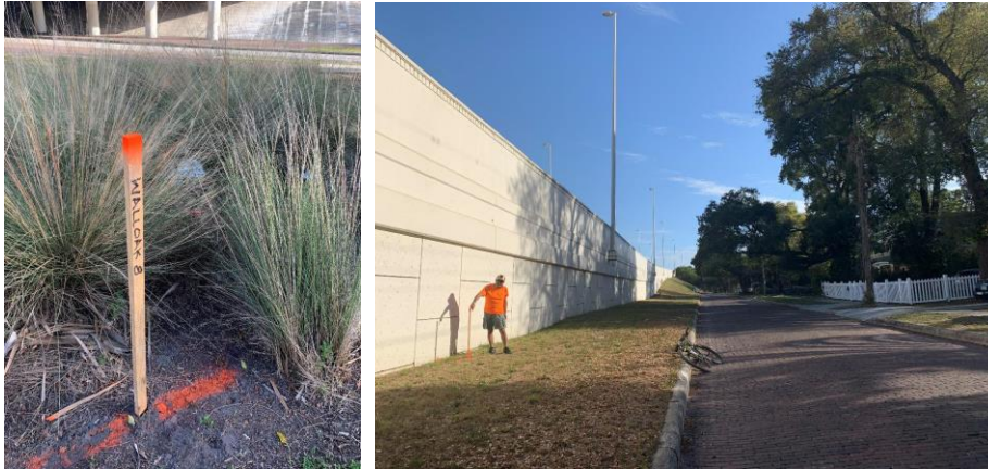
Elmore Ave, just south of Floribraska, looking south.

Pictures – Beth Alden, Tampa Heights Wall (3/8/2022) – Photographs taken on the west side of I-275 and are in order from north to south.