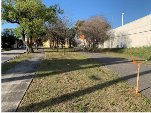
South of Palm Ave, looking back north towards the Tampa Heights Civic Assoc. bldg.