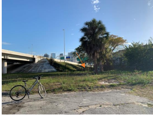
At Henderson Ave looking south.