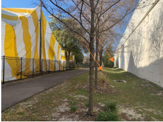
Next to Tampa Heights Civic Assoc. bldg. looking north.