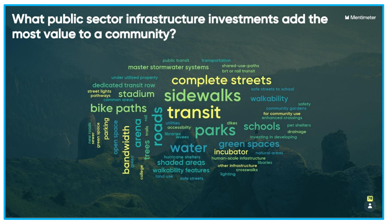
Figure 1: Word cloud summarizing responses of participants to the framing question.

a community?" A word cloud was generated from their responses (Figure 1). The most common responses cited mobility and transportation, followed by infrastructure related to