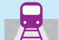
REGIONAL & STATEWIDE RAIL

Imagine a future where we primarily invest in bus and rail services connecting, revitalizing and filling in the communities that exist today.