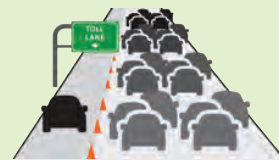
TOLLED EXPRESS LANES