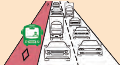
RAPID BUS ON SHOULDERS

Imagine a future where we primarily invest in new technologies and a few roadway projects to manage traffic flow.