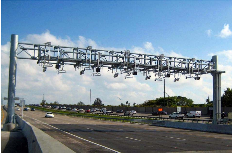
LEVEL 1 – Simple Structure, no architectural treatment