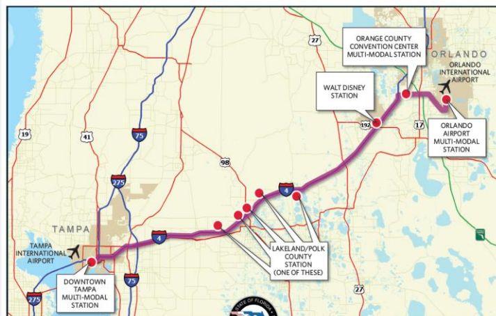
FLORIDA HIGH SPEED RAIL TAMPA-ORLANDO