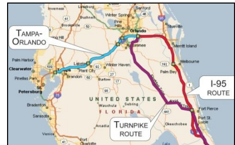
Tampa-Orlando-Miami HSR showing route options for ORL/MIA

Trains will operate at speeds of up to 168 mph. Florida is planning five stations along this corridor. Travel time between downtown Tampa and Orlando International Airport (OIA) including stops at all intermediate stations is projected to be under an hour. The system will be designed to allow the operator to set schedules to maximize ridership and satisfy market demand including the operation of non-stop trains between Tampa and Orlando.